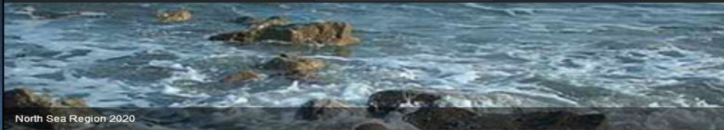
North Sea Region 2020